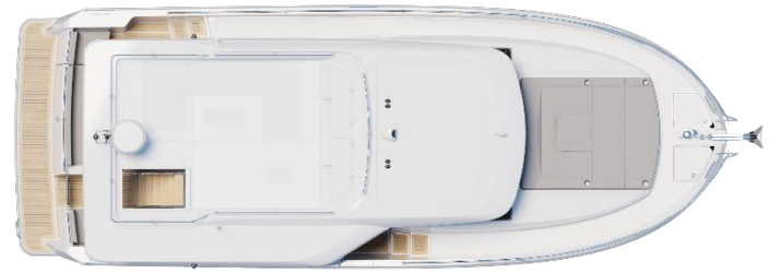
Sedan - Standard