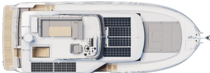
Flybridge - Silent boat option