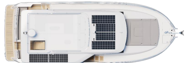
Sedan - Silent boat option