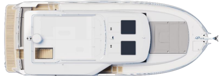
Sedan - Skylight option