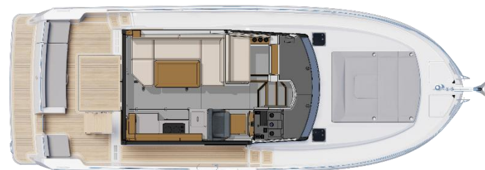
Main deck - Cockpit sliding bench seat option