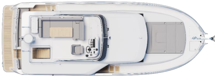
Flybridge - Standard