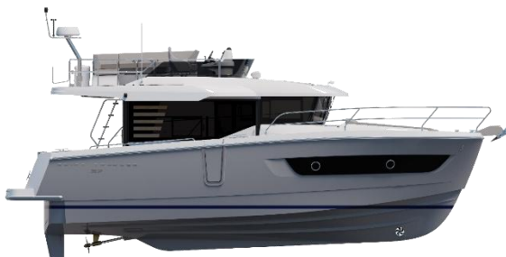
Hull Signal Grey - Flybridge