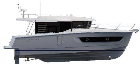
Hull Signal Grey - Sedan