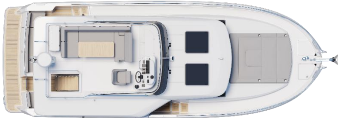
Flybridge - Skylights option