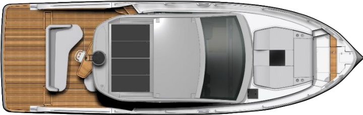
Hard top - Solar Panels IB