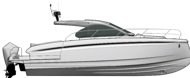
Profil - OB