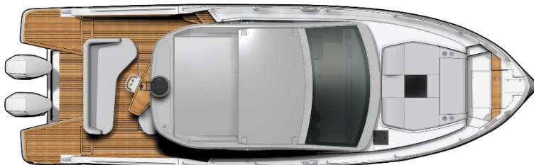
Hard top - OB