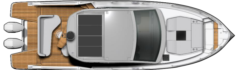
Hard top - Solar Panels OB