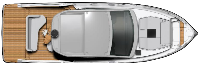
Hard top - IB