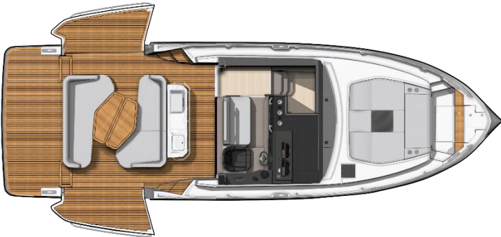
Main deck - IB