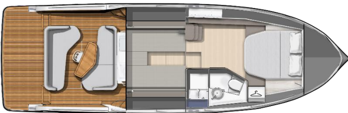
Lower deck - IB