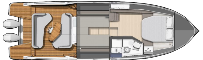
Lower deck - OB