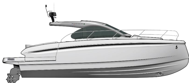
Profil - IB

*inclus support radar / included radar support