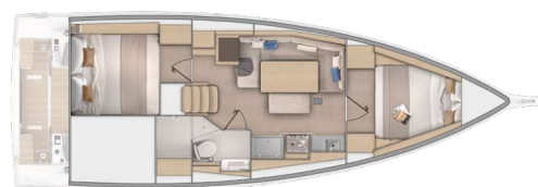
2 cabins / 1 head - Shower