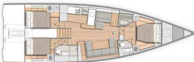
Lower deck – 3 cabins / 2 heads