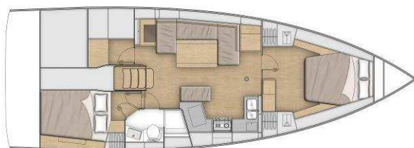
Lower deck – 2 cabins / 1 heads