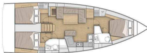
Lower deck – 3 cabins / 2 heads