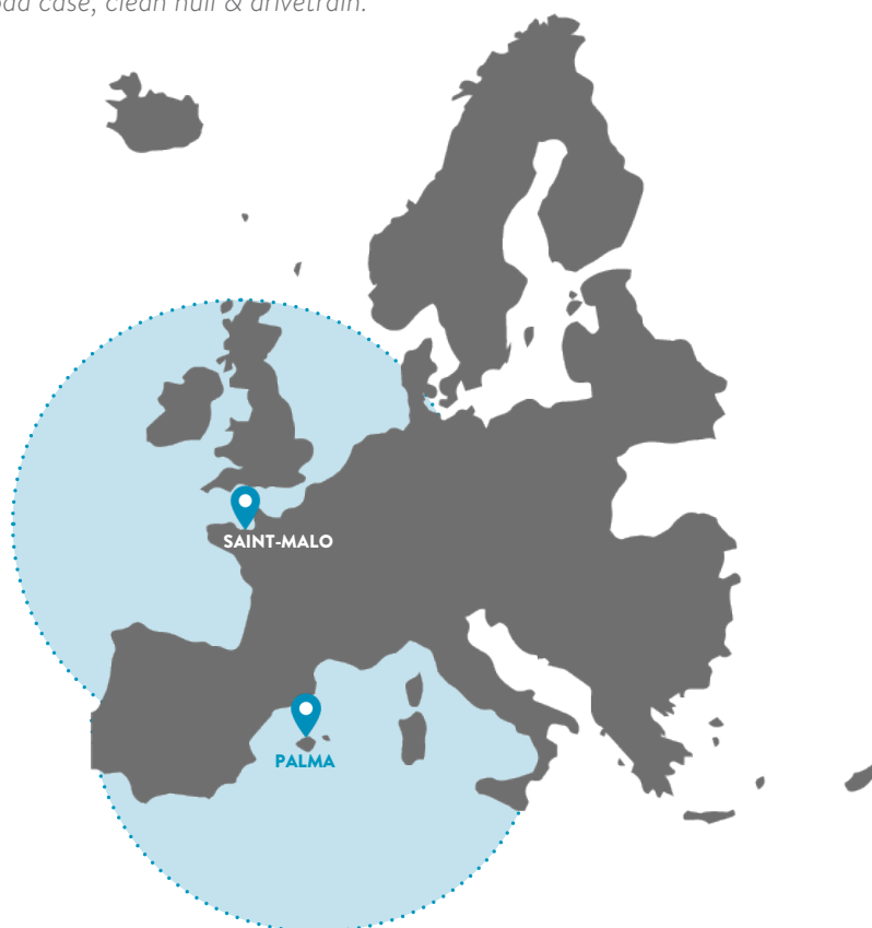
Graphic representation of 600 nm range at 9 knots

*Zero sea state, 50% load case, clean hull & drivetrain.