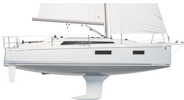
Profile - standard draught