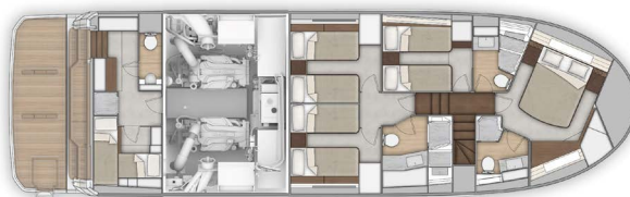
Lower deck - 4 Cabins