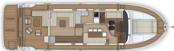
Main deck - 2 pilote seats