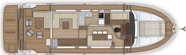
Main deck - 1 pilote seat