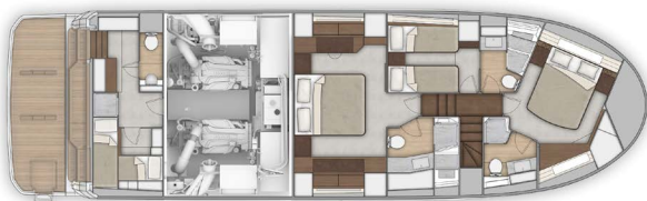
Lower deck - 3 Cabins