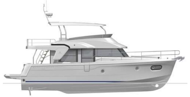
Profile - FLY